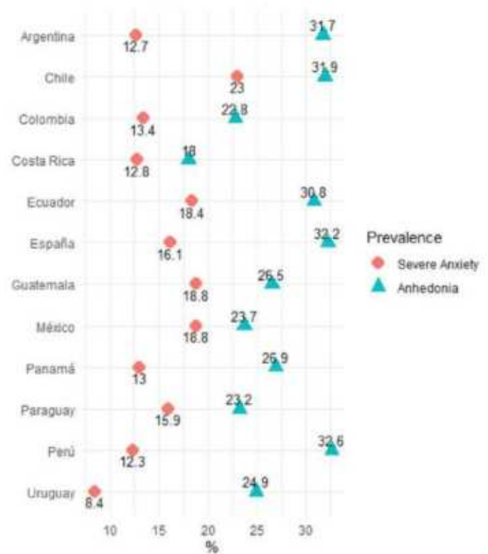
Fig. 1. Severe anxiety and anhedonia by country. Percentage (%) of participants who showed severe anxiety and anhedonia is depicted by country.

We report these results in Table 2 . Firstly, independent of gender, age, level of education, and anhedonia, anxiety was associated with consuming palatable foods, including sugar-sweetened beverages